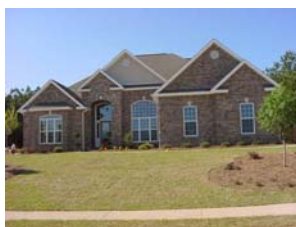
New pad in GA: brick = no termites!