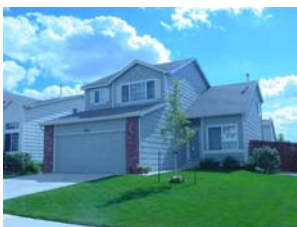
Want our house in CO? Still for sale.

An invitation is always open for everyone to come visit. We could rendezvous in FL but they say the peaches and pecans in GA are out of this world!